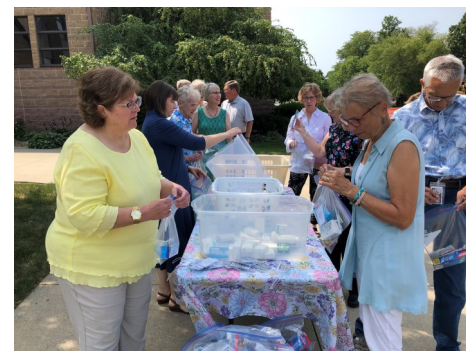
Packing Hygiene Kits