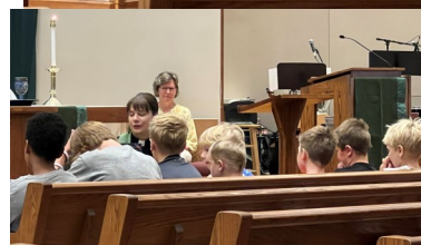
Summer worship series, "Spiritual Wisdom from Fred Rogers"